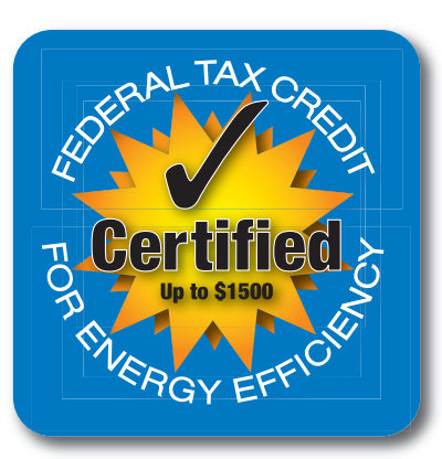
Phifer Incorporated is not a tax advisor. Taxpayers are advised to consult a tax professional regarding their specific ability to claim a tax credit under IRC §25C or other law.

This certification statement meets the prescriptive criteria for such material or system established by the 2009 International Energy Conservation Code, as such Code that was in effect on the date of the enactment of the American Recovery and Reinvestment Act of 2009.